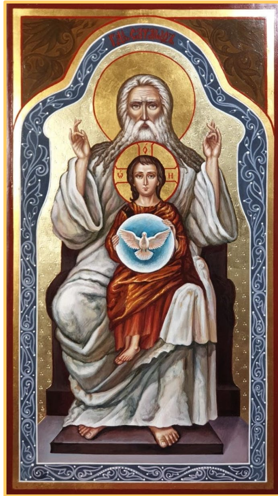
Orthodox Icon of Father, Son and Holy Spirit, The Holy Trinity, Hand Written by IkonArtMaster “On that day you will know that I am in my Father, and you in me, and I in you.” John 14.20