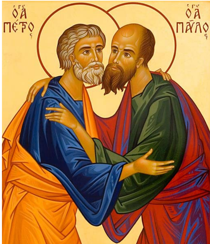
The Bosa icon of the embrace of Saints Peter and Paul